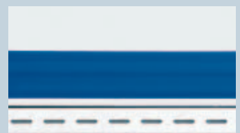
Water protection rail: Prevents water and dust from running under the cabinets