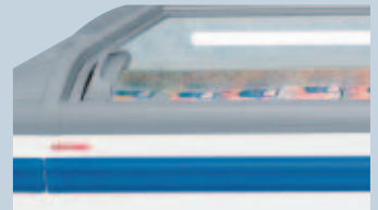
Internal light: To assist customers