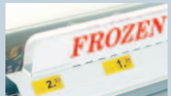
Product labelling and Price tags: To attract customers