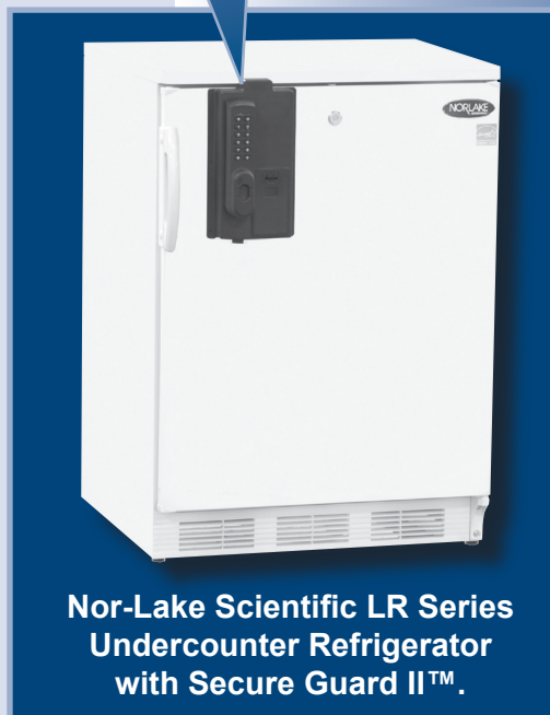
Nor-Lake Scientific LR Series Undercounter Refrigerator with Secure Guard II™.