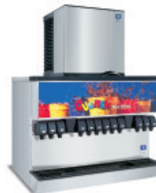
SN-Series 650 Ice Machine on MDH-302 Dispenser