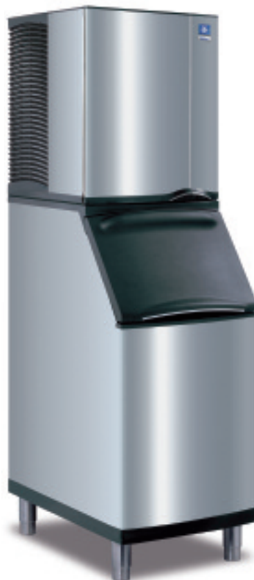
SN-Series 650 Ice Machine on B-420 Bin