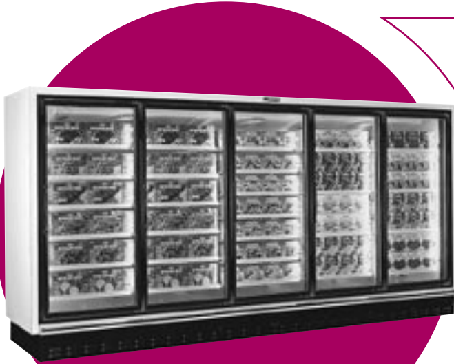
TEL-5-30 (shown with ends installed)